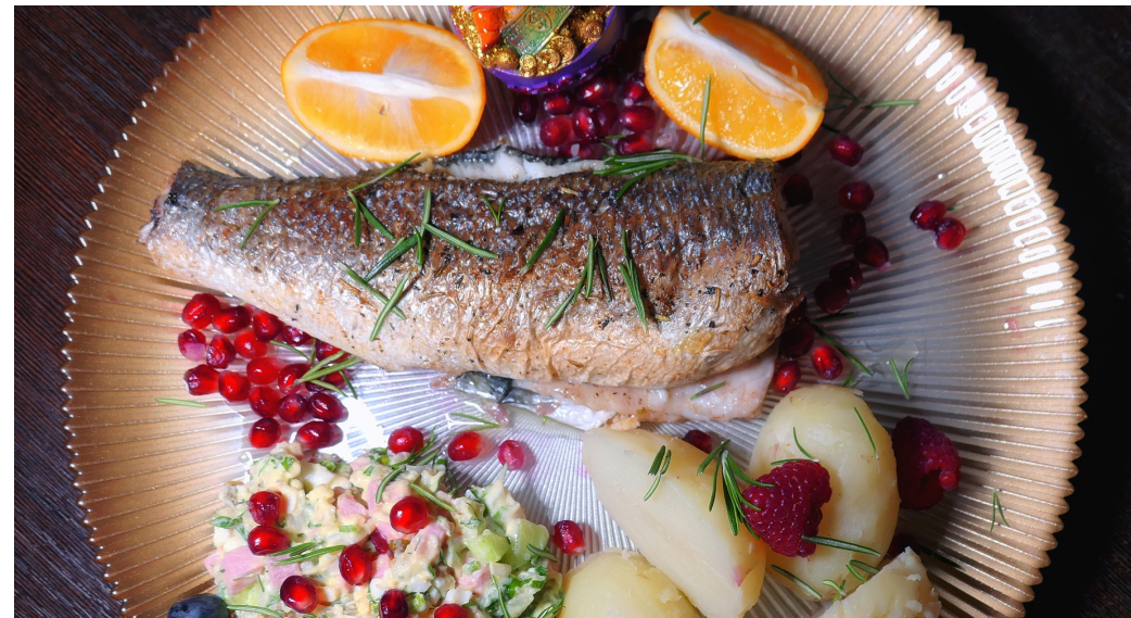
meat & fish