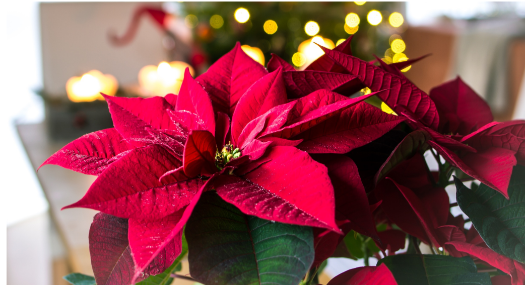
flores de nochebuena