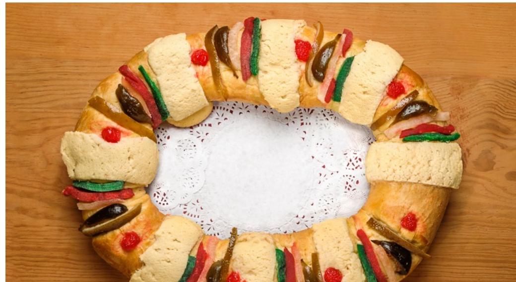
rosca de reyes