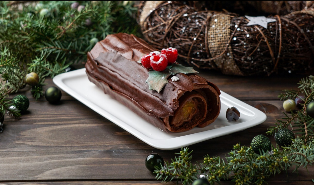
bûche de noel