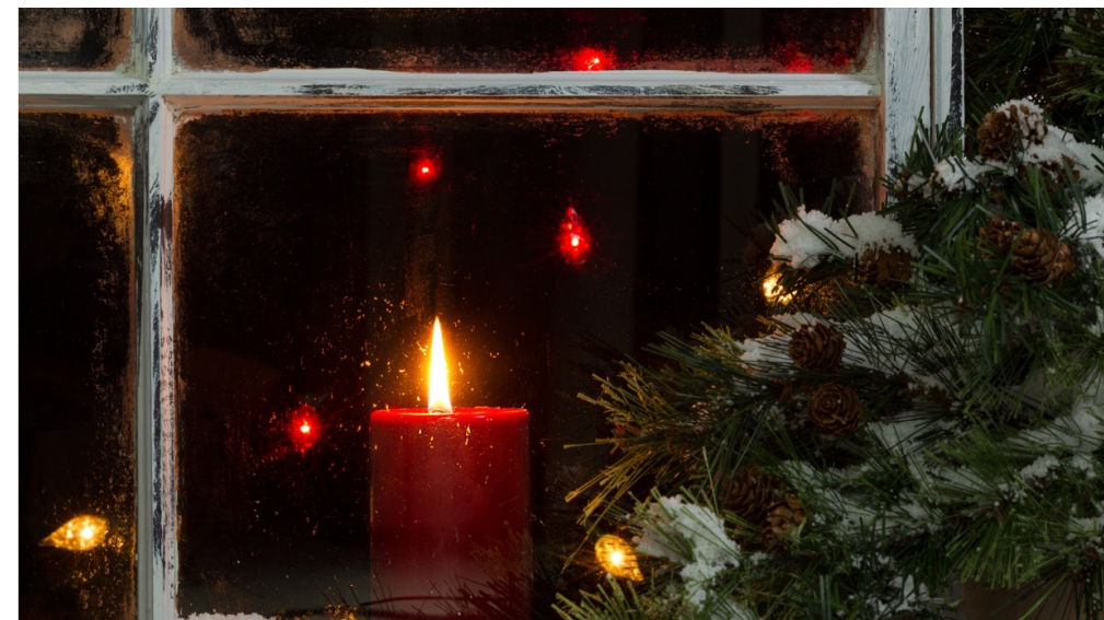
candle in the window